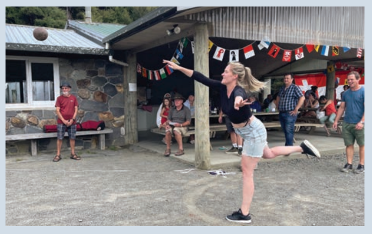
'Frauenpower' in action at the Swiss picnic event and Society Games in Auckland.