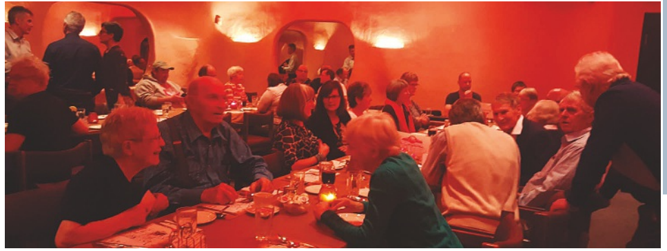
Swiss Club Saskatoon Members at the Annual General Meeting in October 2017