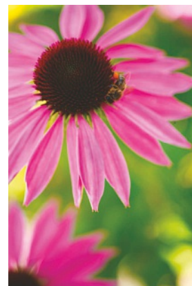
Flowering Echinacea Purpurea