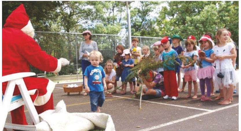
Santa watches the nativity play at Hamilton Christmas party