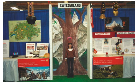
The greatest hit at the Swiss booth was the central display of a manikin representing Tell’s son. It was a target for guests to try to shoot a marshmallow, with a marshmallow-firing crossbow into the apple.