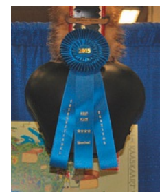
The William Tell display and the 1st place blue ribbon in the educational division which the Swiss booth received.