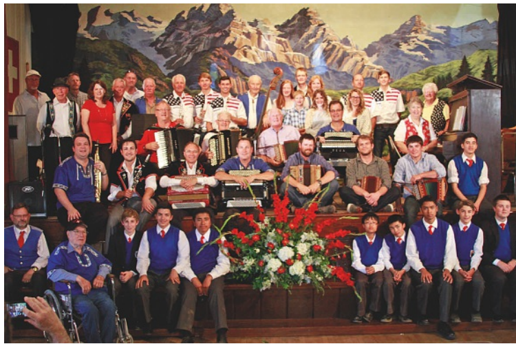
All the artists on stage for the 23rd Pacific Coast MusicFest