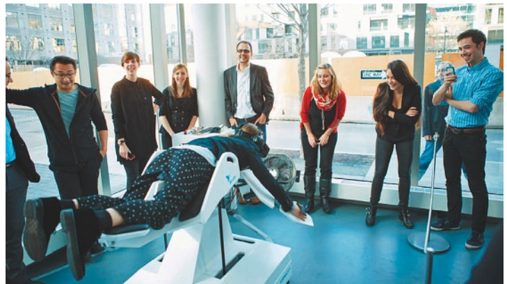
The swissnex Boston Team flying high with Birdly.