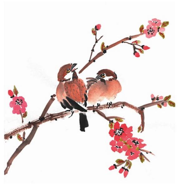
Wal - 2015