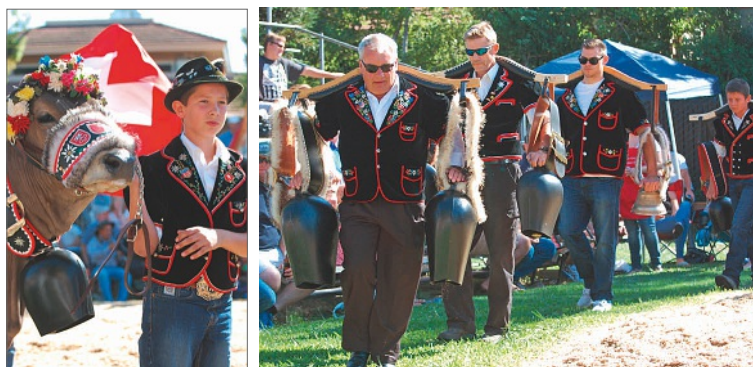
Two views of the colorful Alpauzug with the dairy steer and the cowbell ringers