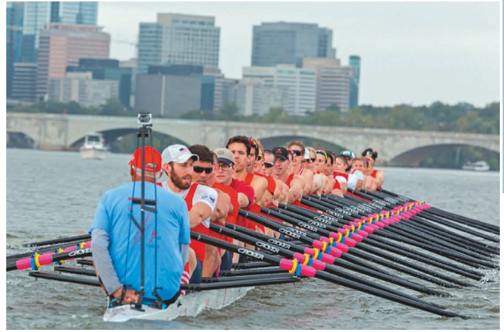
The Stämpfli Express is taken on a spin by 24 elite rowers. Swiss rowing legend Melch Bürgin is coxing

As a major effort in displaying Swiss Innovation and getting people talking about Switzerland in general, we - with support from Presence Switzerland, Basel-Stadt and Swiss International Air Lines - brought the Stämpfli Express to its first-ever tour outside of Europe. From Boston, MA to Chattanooga, TN it was displayed and rowed at