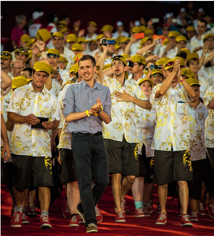
Opening ceremonies. The Swiss Delegation, led by Simon Ammann, the four times Olympic Gold Medalist in Ski-Jumping

The Swiss delegation was competing in 13 different sports (aquatics, athletics, bocce, basketball, cycling, golf, judo, equitation, sailing, soccer men and women, table tennis and tennis) and was very successful. With 14 x gold, 19 x silver and 23 x bronze medals, the medal