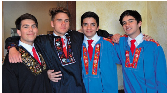
Some of the members of the Golden Gate Boys Choir

The concert included lively songs, including Edelweiss, The Happy Wanderer, and traditional Swiss folksongs in