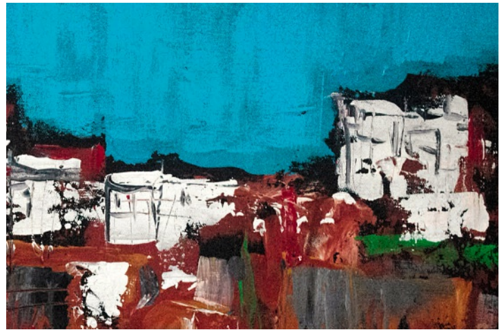
Impression of Morocco 1

Veronique Hahn was born in Casablanca, Morocco, grew up in Morocco, Switzerland, the USA and The Netherlands where she studied Fine Arts at the College of Higher Education of the Arts in Arnhem.