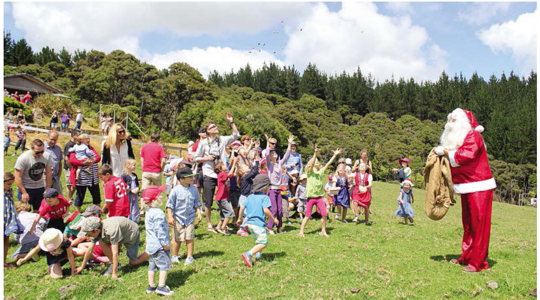
Samichlaus function in New Zealand

Since then, second and third generation descendants have joined the club. We also have many young families, often composed of a Swiss parent