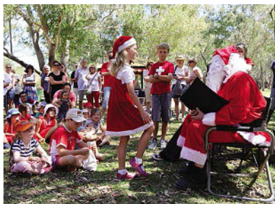
Samichlaus in WA

The year ended with Santa Clause visiting us at Perry Lakes on December 7, talking personally to each child and handing out the traditional “Samichlaus” bags with nuts and goodies. 2015 will start with the AGM on Feb 22.