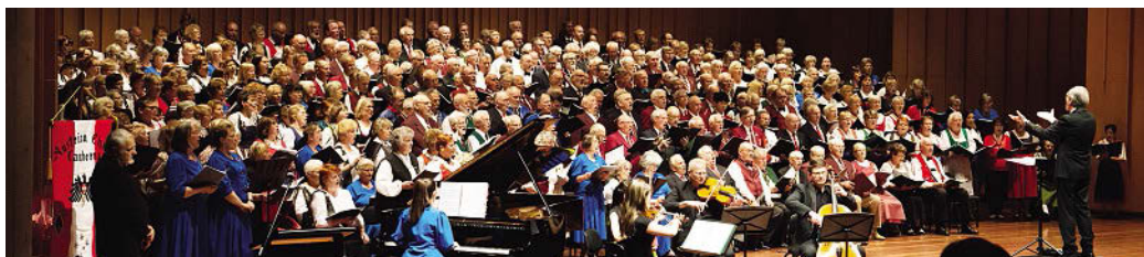
Swiss Yodlers of Sydney taking part at the triannual German Sangerfest

Swiss Play Group impressions from recent trips to the zoo and the spring craft event.