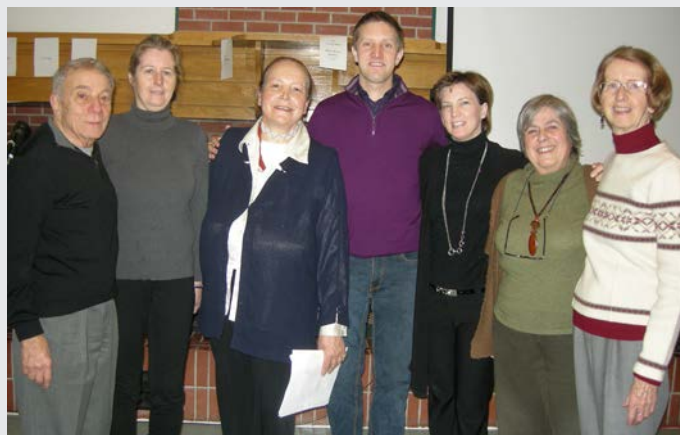
Ottawa Valley Swiss Club Board of Directors 2014