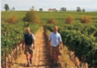
Eikendal is one of the most prestigious wine brands of South African Twist Travel

The brand is passionately owned by the Swiss Saager family from Zurich with Eikendal Vineyards founded in 1981. The 70 ha farm produces 200'000 to 250'000 bottles of wine every year, thereof 70% for export. The cooling, moistening effect of the breezes from the nearby