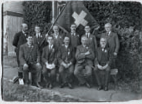
Some of our compatriots around 1914-1918