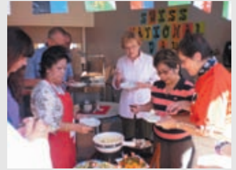
Swiss National Day celebrations in Maryborough